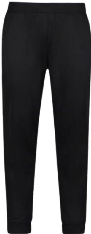
Track Pants $40