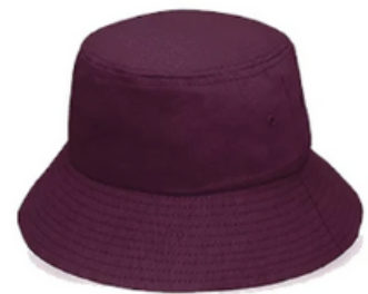
Bucket Hat years 7-12 only $11