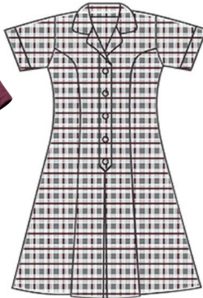
Summer Dress $65