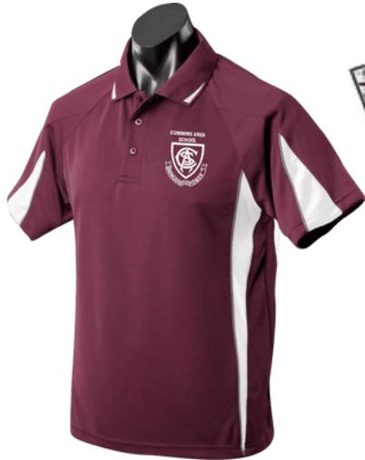
Polo shirt $34

Order by phone or on directly from the website