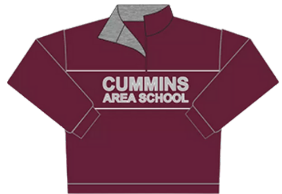
Boss Top $60